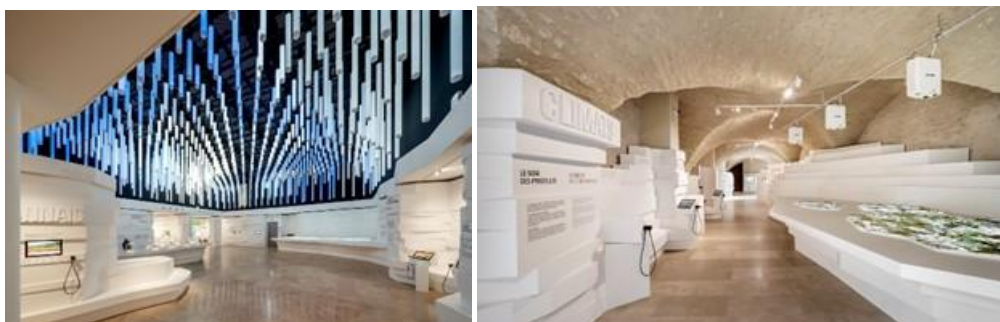
Visitor trail, Cité in Mâcon and Chablis

A reward in perfect harmony with the views of the visiting public on this innovative scenography, which retraces by layers the history of the Bourgogne vineyard from North to South.